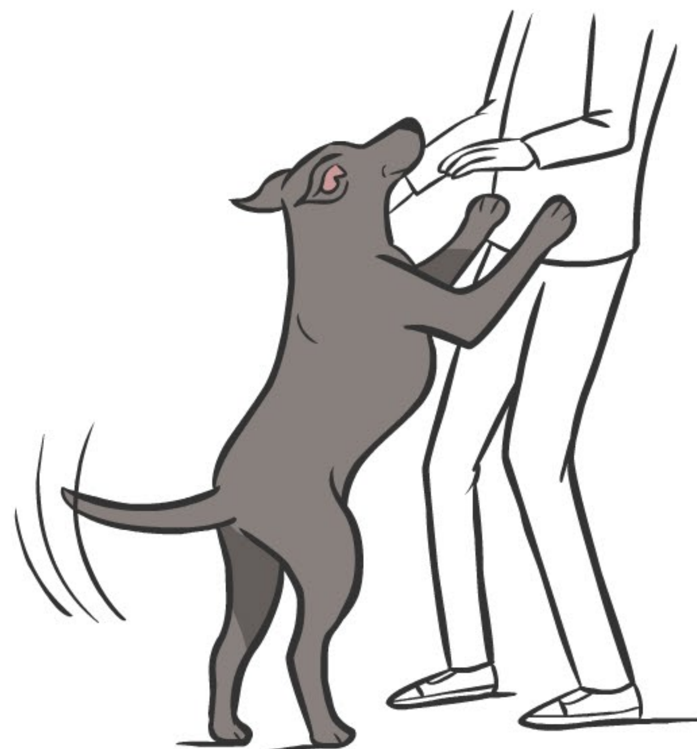
Jumping on people