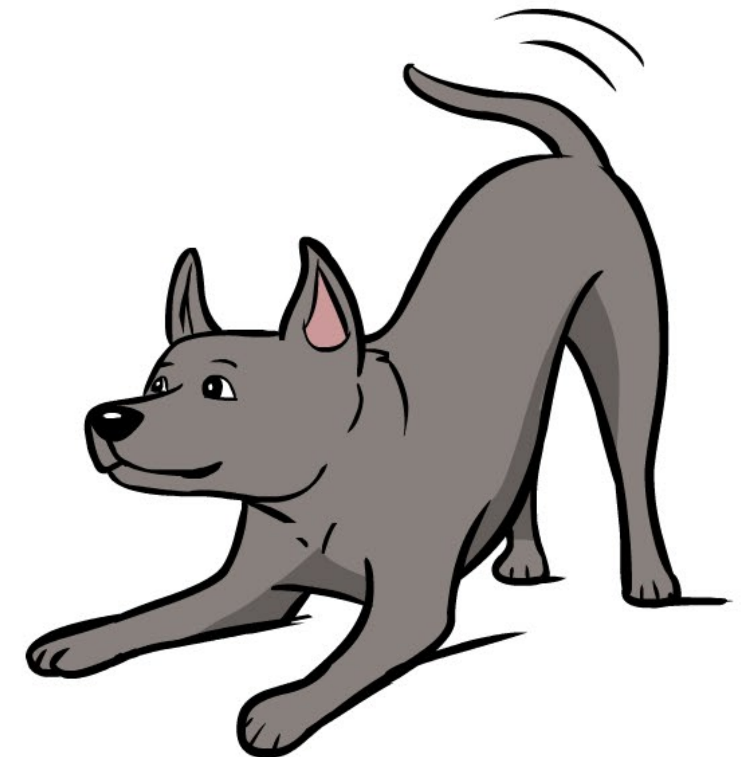
Playful: excited playbow